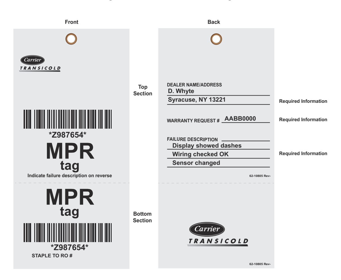
Figure 6.1 MPR Return Material Tag

5. For all other warranty replaced parts, the MPR Tag can be used as a reference to hold part until the claim has been paid or the specific part is requested for return to Carrier Transicold. Refer to previous section for part disposition requirements.